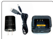
Desk Charger BC-508