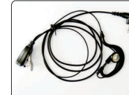
AE-HL HRE Earpiece