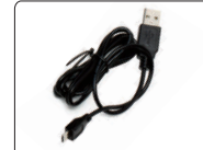
USB Charger Cable