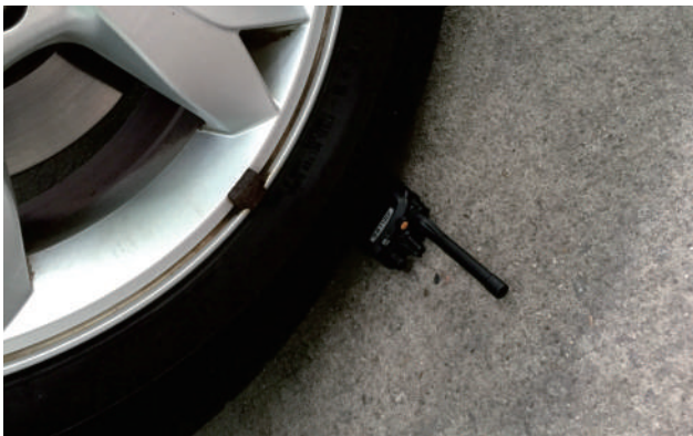
1.5 Ton Anti-pressure

Dust and water proof Class IP54 (IP56 in U.K. area)