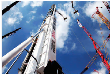
Construction & Manufacturing