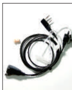
AE-ATS Acoustic tube earphone