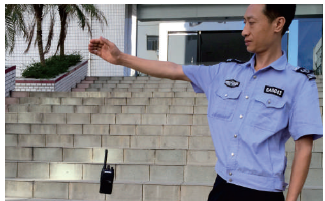
1.5 Meter Anti-dropping