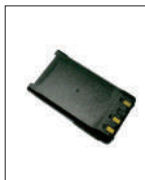
High capacity 1600mAh Li-ion Battery