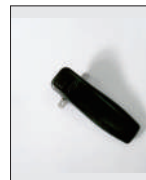
Plastic belt clip