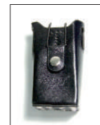
Leather carrying case